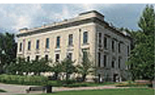
Indiana State University