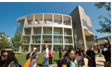
Cleveland State University

These universities grant academic credit to students who are enrolled at them.