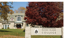
Rhode Island College