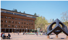
Western Washington University

These universities grant academic credit to students enrolled at them and can also grant transfer academic credit to students from other colleges who apply to the KCP program through them.