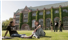
University of Idaho