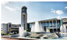
Missouri State University